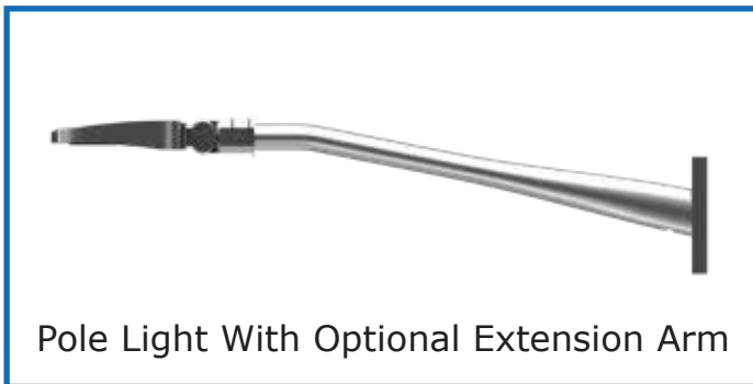
Pole Light With Optional Extension Arm